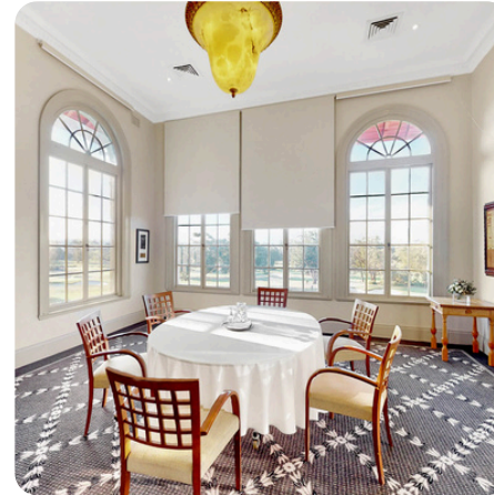
The Founders Room